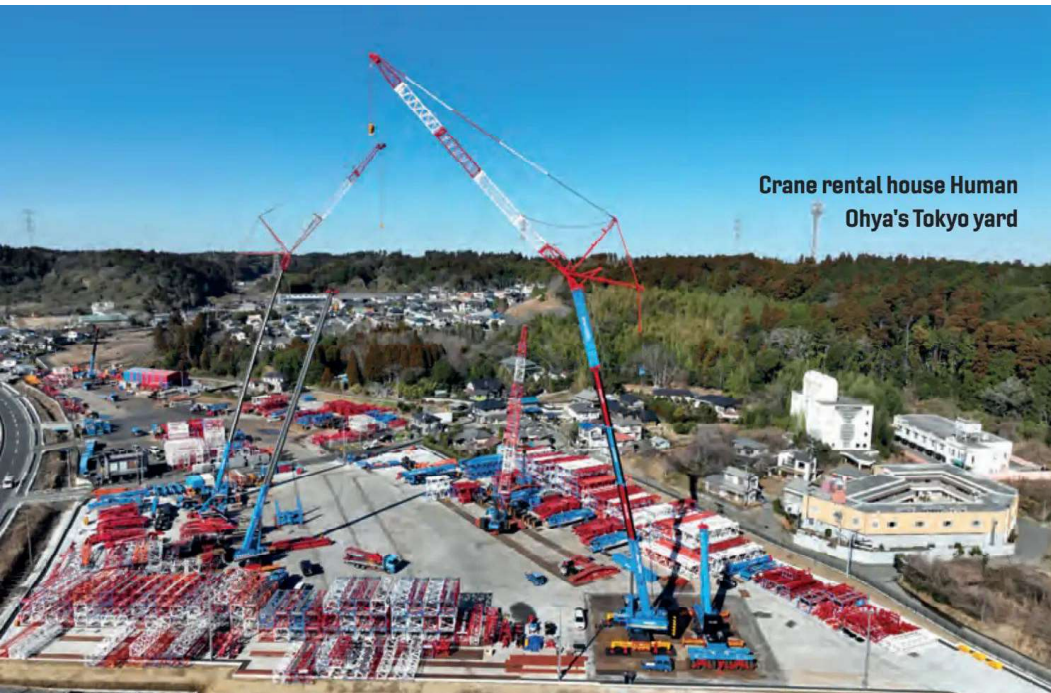
Crane rental house Human Ohya's Tokyo yard